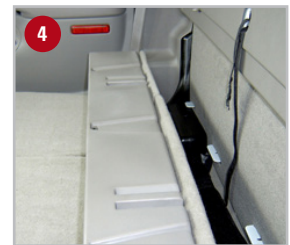
The DU-HA bolts to rear floor flaps to allow access to jack when tilted forward.