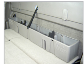
This is how the DU-HA should look installed behind the back seat.